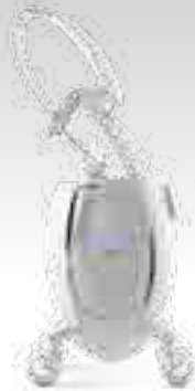
Cellu M6° Integral [2] ⓘ

Weight: 168 lbs Dimensions (L x w x h): 31x27x66 inches Frequency: 2 – 16 Hz Pressure: 690 mbar Output: 26.15yd 3 /h Sound level: 56 dBA Electrical characteristics: 100-240 V / 50-60 Hz / 625-650 W Color touchscreen: 10"4 Energy saving mode: yes Audio: yes USB Port: yes